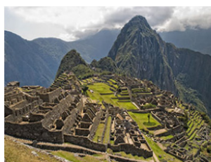
PERU EXPRESS TOURS DAYS: 08 DAYS USA - LIMA - CUZCO - MACHU PICCHU - LIMA - USA

Destination and Departure Dates: Peru – Feb. 9, 2018 India – Mar. 31, 2017 S. Africa – Sept. 20, 2017 Trip Cost to Chamber Member Peru - $2,190 India - $2,190 S. Africa - $2,990