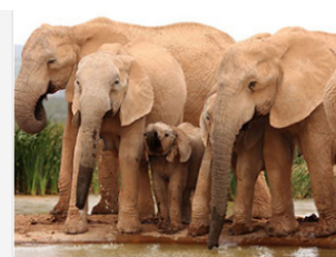
SUPER SOUTH AFRICA TOURS DAYS: 11 DAYS USA - JOHANNESBURG - KRUGER NATIONAL PARK - STELLENBOSCH - CAPE TOWN - USA