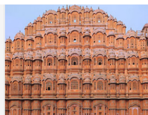
DISCOVER INDIA TOURS DAYS: 10 DAYS USA - DELHI - AGRA - BHARATPUR - JAIPUR - DELHI - USA